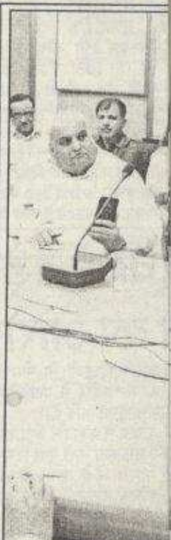
चंडीगढ़ में एक सामा एक प्रेस कॉन्फ्रेंस को